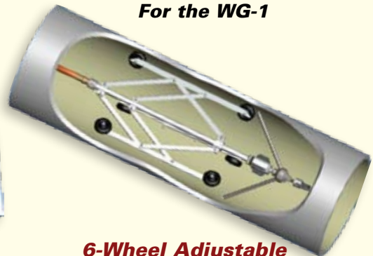
6-Wheel Adjustable Centralizer WG-286-M-P16 For 13" to 40" diameters.