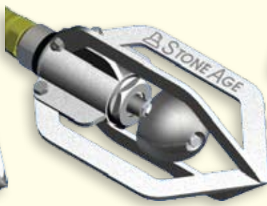
Super Centralizer WH-085 - 5.6" diameter WG-085 - 6.9" diameter